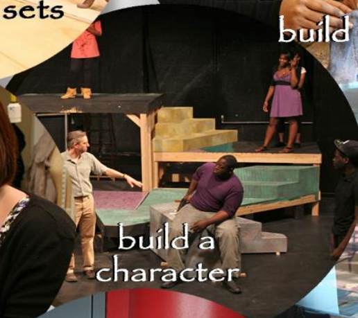
build a character