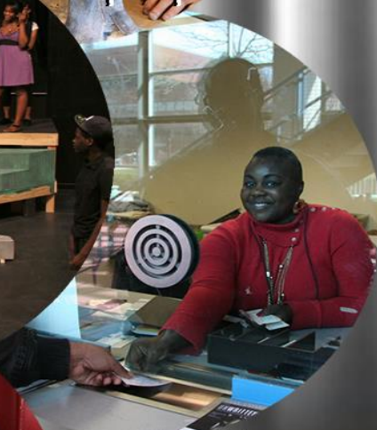
build an audience